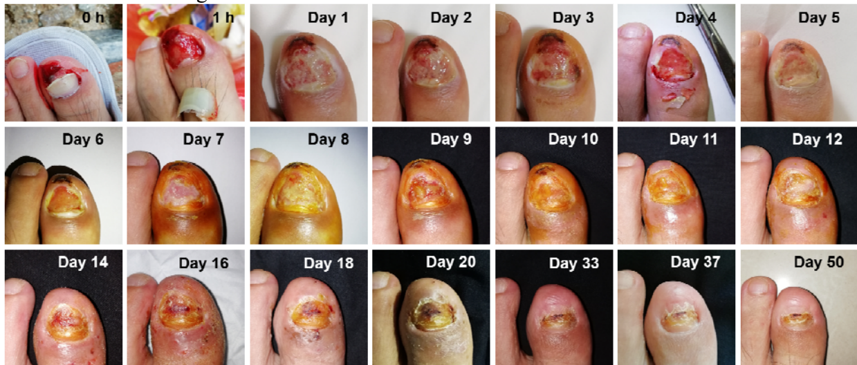
Figure 1: The healing process after toenail injury. 0h: Initial post-traumatic appearance; 1h: The appearance of the damaged nail after removal; Day 1: The first day after the trauma, Day 2 to Day 50 and so on.

day after the injury (a week after the gout attack), the swelling of his left first metatarsophalangeal joint and back of foot had subsided and the pain had been significantly relieved ( Figure 2, Day 14 ). He stopped ibuprofen but continued to take benzbromarone and sodium bicarbonate tablets for a week, then he underwent a laboratory test with uric acid levels at 87 \mu\text{mol/L} ( Figure 3, Time = 3.5 months ). Considering that the gouty arthritis was cured, he stopped taking benzbromarone and sodium bicarbonate tablets and changed to a conservative treatment to control blood uric acid levels through dietary adjustments. Two weeks later, he re-examined with the uric acid levels at 380 \mu\text{mol/L} ( Figure 3, Time = 4 months ). After that, he subsequently re-examined the blood uric acid on 3, 6, and 9 months after the gout attack, the level has fluctuated between 460 and 508 \mu\text{mol/L} ( Figure 3, Time = 6-12 months ). Now, the student plans to follow a strict diet under the guidance of his teacher to prevent a recurrence of gout.