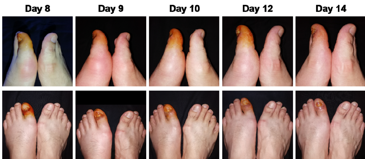
Figure 2: The appearance of first metatarsophalangeal joint and back of foot during gouty arthritis attacks. Day 8: The first day of gouty arthritis attacks, and the eighth day after the trauma, Day 9 to Day 14 and so on.