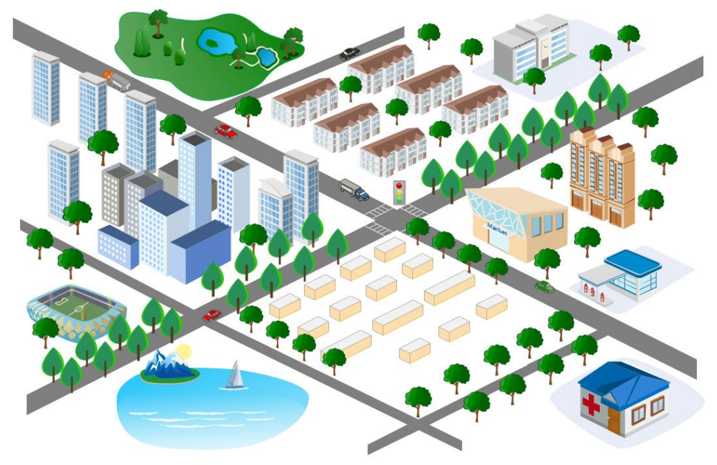
Figure 1: Traffic moving line design

In view of its rugged roads, it is not recommended to rebuild its road paths, because it is necessary to maintain its original forest spatial characteristics. In this case, some small spaces can be opened at intervals on both sides of the road, which can be lawn spaces or wooden rest platforms to encourage people to stay here and fully enjoy the recuperation function of the park forest oxygen bar. In order for passing tourists to find out in time, we can choose some areas with sufficient sunshine or areas with strong plant enclosure effect to meet the leisure preferences of different groups of people. The layout should be adjusted according to the content of urban parks and the capacity of tourists, and the priority should be clear and local conditions should be adjusted (Figure 1).