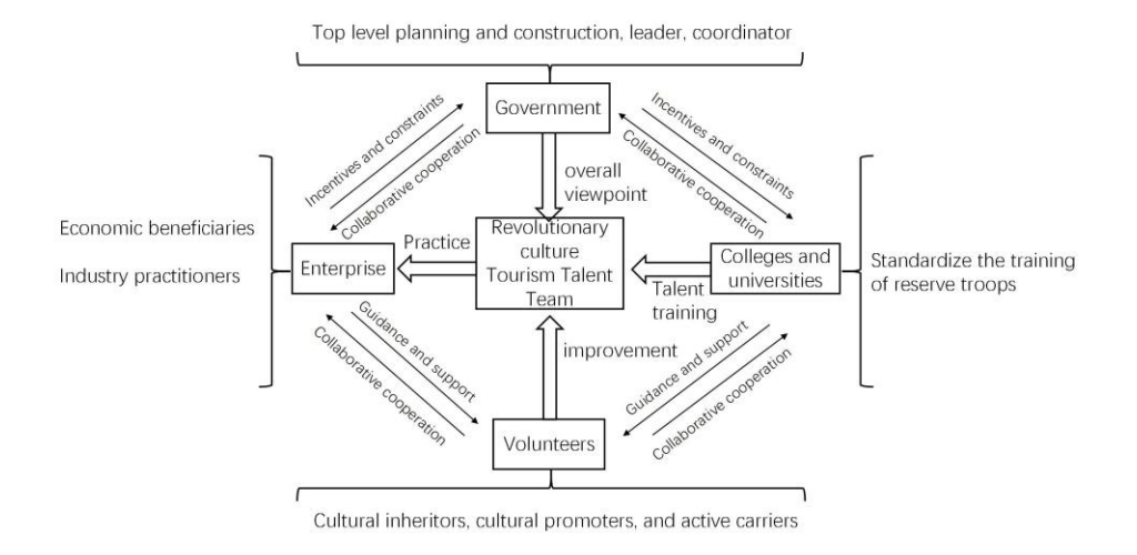
Figure 5: Relationship Diagram of CPC Heritage Tourism Talent Team Training

The international communication talent team can conduct specialized enrollment and training, forming a training model of Revolutionary Culture+international communication. In order to break the invisible cultural boundaries and improve the quality and impact of the dissemination of CPC heritage tourism industry, it is necessary to cultivate cross-cultural communication talents with a global perspective, understanding international cultural rules, respecting international cultural differences, and strong Chinese cultural literacy.