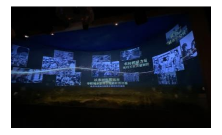
Figure 4: Taken by the author