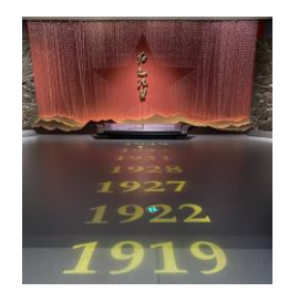
Figure 3: Taken by the author