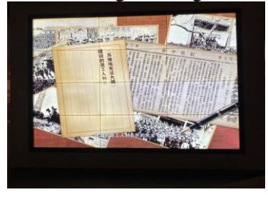
Figure 2: Taken by the author

and problems of sufficient quantity but insufficient quality. The supply of high-quality tourism service experience is insufficient. Through digital access, most of the existing CPC heritage tourism industries adopt a combination of online and offline tourism methods. For example, the recently launched "cloud tourism" allows visitors to visit scenic spots 24 hours a day without leaving their homes. To a certain extent, it solves the dilemma of people's fast pace of life and inability to travel. However, in the process of traveling, digitization is used as a gimmick to attract attention, but in the end, only simple images, text, film, and television are used to spread cultural content, making it difficult for tourists to experience and interact, and lacking a sense of experience of high-quality tourism service. Some examples are shown in figure 2, figure 3 and figure 4.