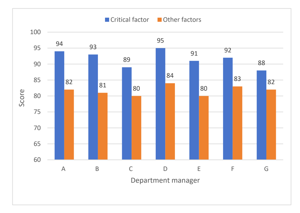
Figure 3: Questionnaire survey results on the evaluation of important factors of corporate accounting systems

Among them, the blue column indicates the importance rating of key factors of the enterprise's accounting system, and the orange column indicates the importance rating of other factors of the enterprise's accounting system. It can be seen that the comprehensive evaluation of the four important factors by the seven department managers is at or above 80 points. Among them, the comprehensive score for the key factors of the corporate accounting system is about 91.7 points, and the comprehensive score for other factors of the corporate accounting system is about 81.7 points. This shows that the <sup>analysis</sup> of the importance of corporate accounting systems from a management perspective is accurate. At the same time, corporate accounting systems do play a key role in actual operations and are recognized by the majority of corporate managers.