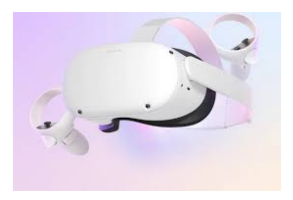
Figure. 9 White Oculus Rift Quest VR headset

The Oculus Quest is one of the most well known VR headsets that people use. It has a huge selection of games in its database available for purchase. However, it has a price tag of 299 dollars,