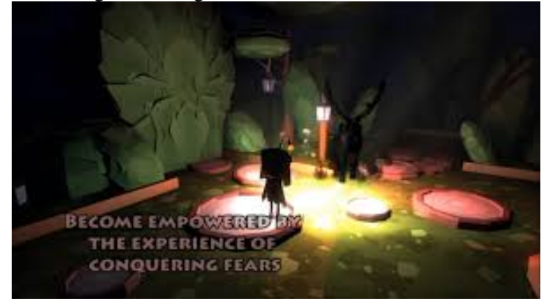
Figure. 7 A gameplay of the game MindLight, the yellow light is generated by CBT headsets when the player's brain is relaxed

This game utilized neurofeedback CBT headsets as part of game play. When the player's brain is more relaxed, more light will be generated. The result showed reduced anxiety.