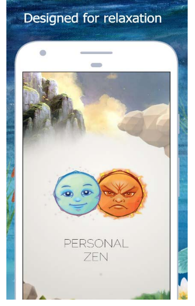
Figure. 5 Personal Zen's two sprites, the blue is a non-threatening sprite and the orange is a threatening sprite

The game's objective is to trace the trails of a non-threatening sprite to implicitly train the player's brain to stay away from negative stimuli, which in turn reduces anxiety and stress significantly.