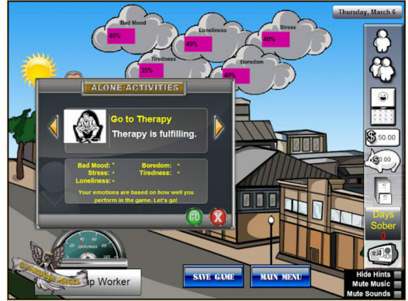
Figure. 8 Gameplay of the game Guardian Angel. Each cloud represents a negative emotion

This game was created for the individual patient. It is specifically geared towards resembling the individual player by creating characters in the game that are "almost exactly identical" <sup>1</sup> to the player/patient.