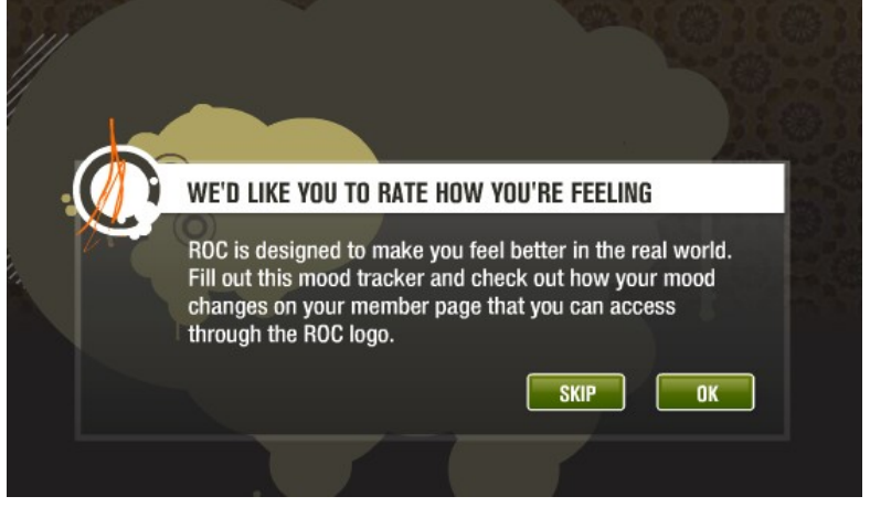
Figure. 4 Mood tracker of Reach out Central

This game focused on identifying and developing stress coping skills with mood trackers. The results<sup>1</sup> showed that the participants were more likely to seek help after playing the game.