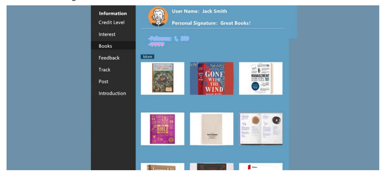
Figure 3: User home page

Users can enter the book details writing page by clicking publish books on the personal homepage. Use the markdown editor component of maven-editor. After entering the book information, the back end receives the information in HTML format and transmits the content to the database, and then the publishing is completed. The post-release information appears on the personal home page (as shown in figure 3). All users can access other people's home page and view the products published by users in the main part of the page. The left navigation bar of the page also provides other information such as user credit rating, the content of concern, evaluation, etc.