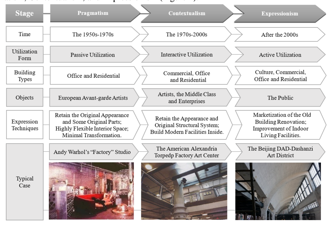
Figure 1: The Evolution of the Industrial-Style Architectural Interior Decoration.

The Industrial Revolution brought human civilization into a new era. However, the factories built at that time were gradually abandoned with the develop of the third industry [2]. Until the 1970s, industrial buildings began to be transformed and reused in Europe and rapidly spread to the United States, Russia, Japan, and China. At the same time, the industrial nostalgic trend has also emerged. The industrial-style architectural interior has been gradually valued and adopted throughout the world. The design methods, spatial structures, and scene images of industrial style were constantly innovating, which has experienced three main stages in its transition and transformation: Pragmatism, Contextualism, and Expressionism (Figure 1).