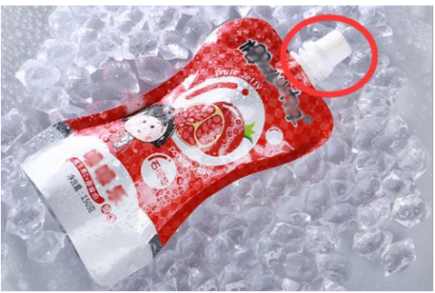
Fig.1 Packaging Mouth Made by Plastic Material

touches the packaging mouth, and most plastic materials are not labeled hurtlessness to children. As shown in the Figure 1.