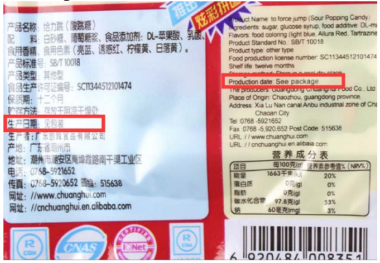
Fig.3 Position of Packaged Foods is Uncertain

the package", some of the labels are "production date: see at the sealing point", the identification of packaged foods is inaccurate and the position uncertain. As shown in the Figure 3.