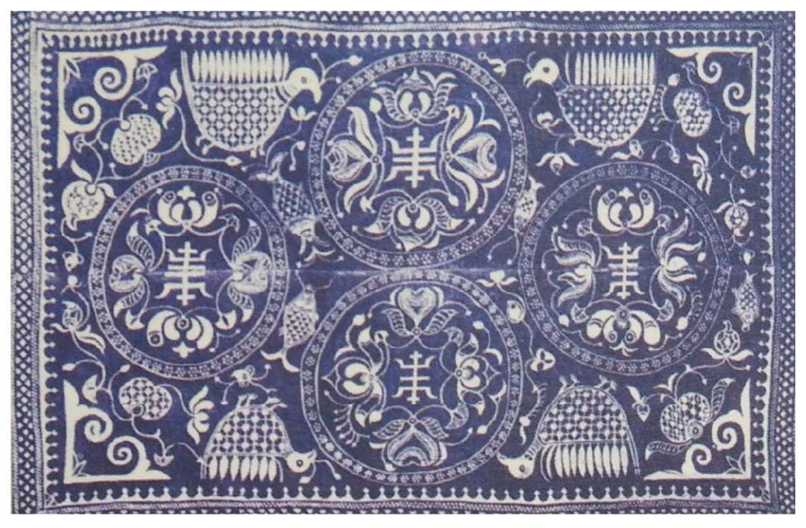
Fig.7 Batik Back of Miao People's Shouzi Flower and Bird Group Flower

The aesthetic value of Miao batik patterns in Western Hunan is mainly reflected in the sense of reproduction, life and religion. The sense of reproduction originates from people's reverence for life and people's pursuit of objective significance, which greatly affects the unique aesthetic value of batik patterns of Miao people. Life consciousness is the Miao people's understanding of the concept of survival. When the survival consciousness of life as a kind of cultural reproduction and people's vision, Miao people evaluate each individual life with truth, goodness and beauty, and penetrate into Miao batik culture. The religious consciousness mainly comes from people's admiration of witchcraft in primitive religion. In the religious activities full of truth and falsehood, the mystery of Miao folk art endows the Miao people in Western Hunan with the illusory beauty of batik. Miao people have a unique understanding of life. They think that the origin of life is inextricably linked with everything in the world, and that nature gives them life. This understanding of the concept of life makes them know how to be grateful, how to give back, how to respect nature, and how to understand the equality between people. It is this understanding of life that leads to the unique aesthetic value of Miao people, which is also displayed incisively and vividly in Guizhou Miao batik patterns.