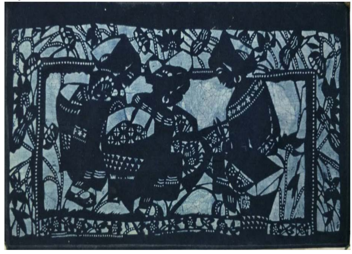
Fig.1 Batik Display

Batik is an ancient and unique art of hand-made painting and dyeing of the Chinese nation. Batik is the combination of batik and dyeing, and it was called wax picking in ancient times. Batik is to dip a wax knife into melted wax to draw various patterns on cloth and then dip it with indigo. After dyeing and removing wax, the cloth surface will show various patterns of blue flowers on white background or white flowers on blue background. At the same time, in the process of dip dyeing, the wax as a dyestuff will naturally crack, and there will be a special "ice pattern" on the cloth surface, which has unique charm. Because batik pattern is very rich, unique style, simple and elegant color, it is used to make clothing and various practical articles for life, which is quite simple and generous, fresh and pleasant to the eyes, rich in unique national characteristics. Batik works are shown in Figure 1