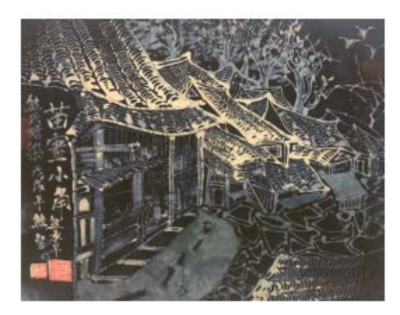
Fig.2 Xiong Chengzao's Representative Work "Xiaojiao of Miao Village"