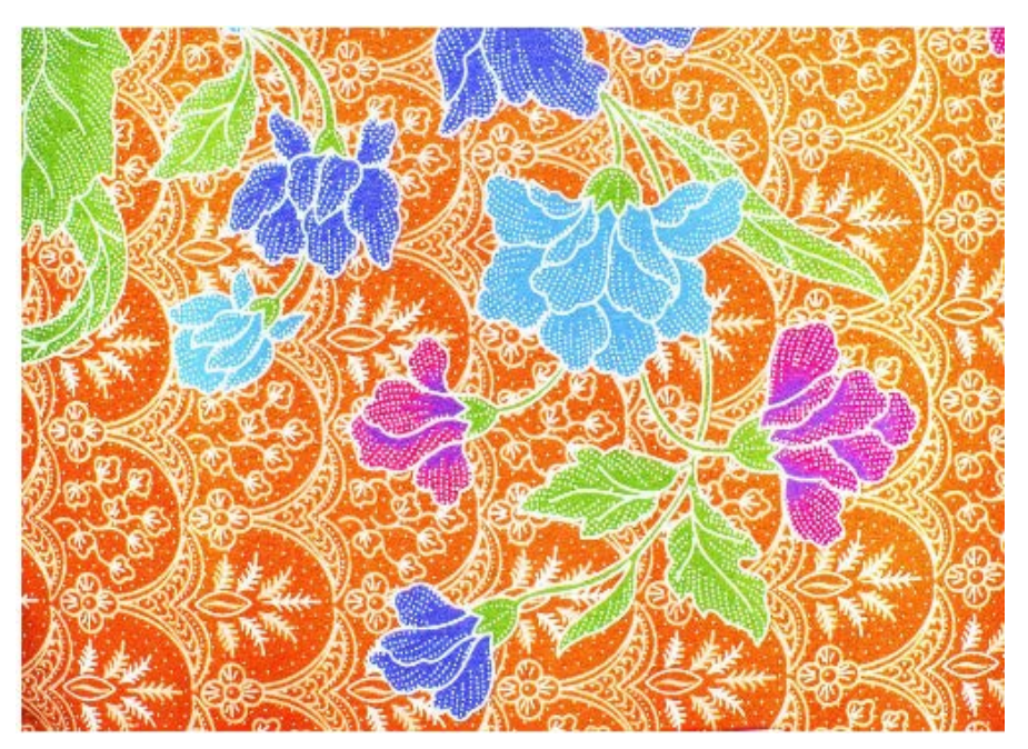
Fig.5 Batik Multicolor Pattern