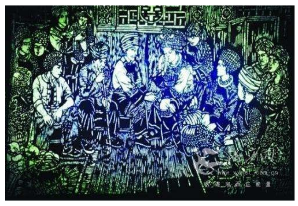
Fig.6 Ice Crack Pattern of Batik

It can be seen that Miao batik in Western Hunan is a kind of folk art. Its patterns and patterns have strong regional characteristics, and the content also has a certain historical origin and cultural heritage. With the long-term historical inheritance of Miao batik, it has formed its own unique style. There are different patterns in the description of patterns, which express the unique cultural connotation. From the functional point of view, due to the strong mobility of local residents living at that time, the pattern was drawn on clothes, which was easy to carry and inherit. At the same time, the patterns and shapes of the patterns have strong regional characteristics, forming different styles and styles from other regions, and infiltrating the lifestyle and behavior habits of Miao people in different places.