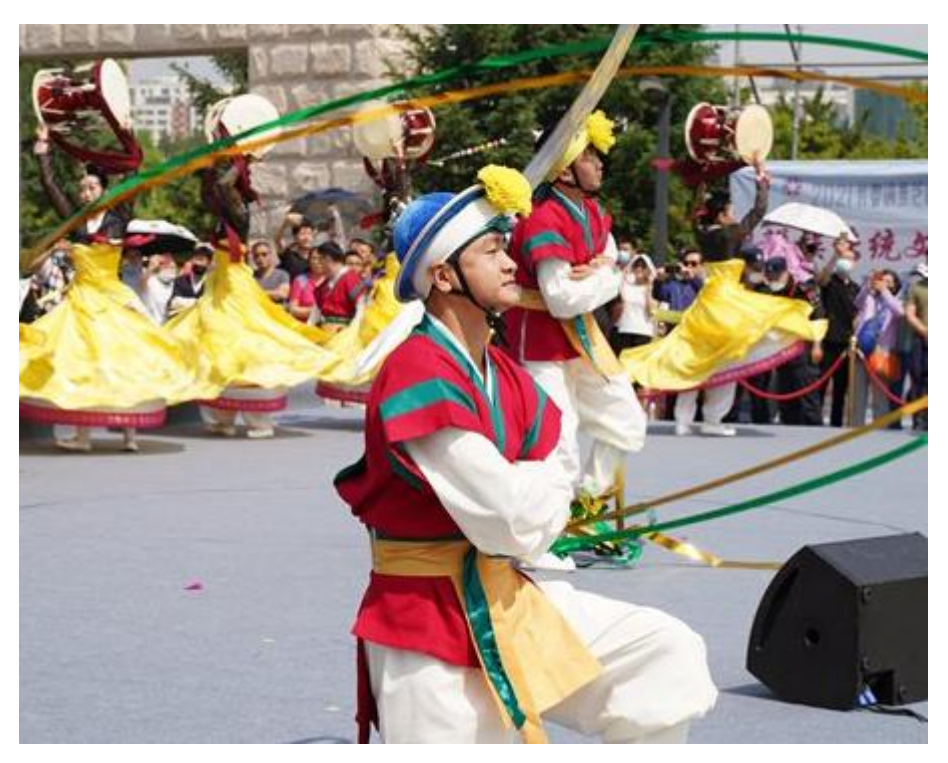
Fig.3 Korean Elephant Hat Dance