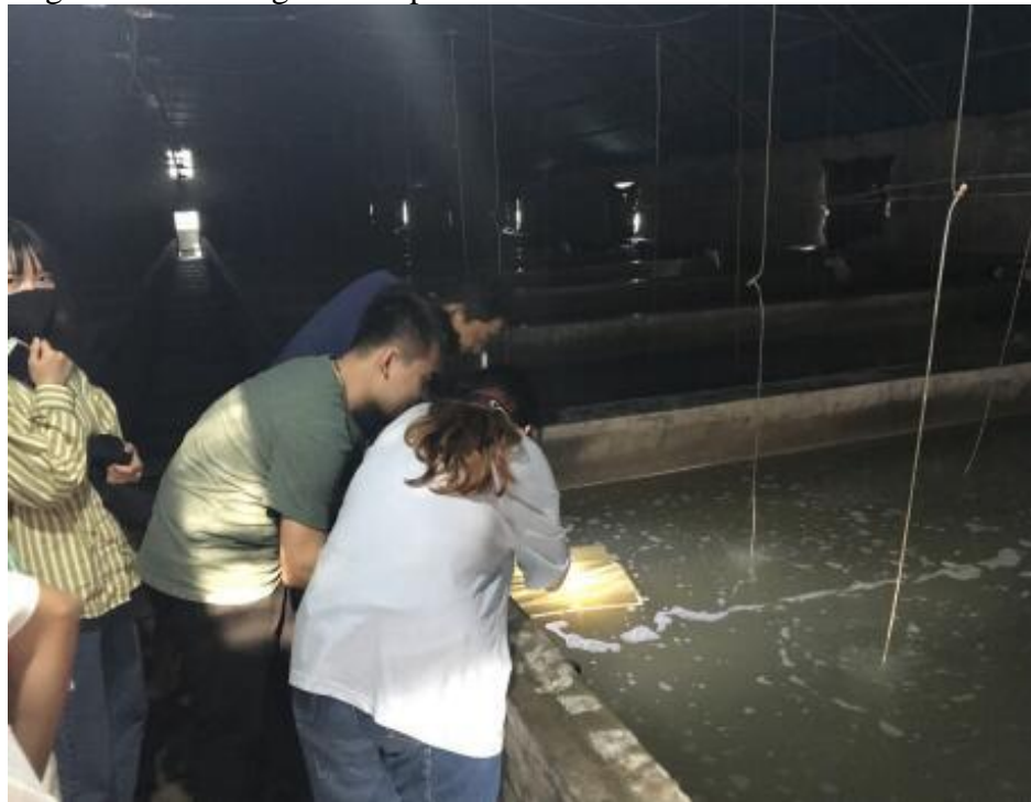
Figure 1: Farm research

and have a thorough understanding of all aspects of them.