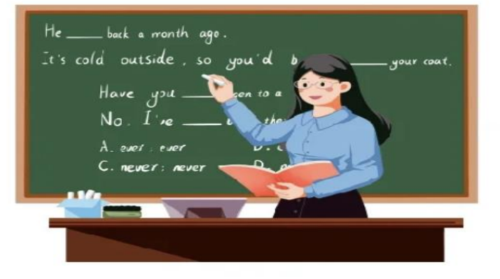
Figure 4: It is important to improve reading ability