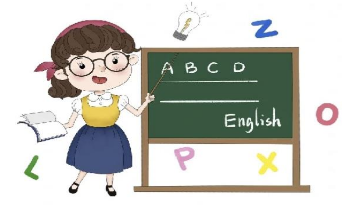
Figure 1: Diversification of teaching methods

achievements have been recognized, and his confidence has also been improved. For example, when teaching English listening, we should not take out everything that is said in class. Instead, we can play a few familiar English songs for them; For example, in the English translation of 'The Lonely Warrior', having the child hum in a familiar tone before class can help the child bravely speak their English and overcome the fear of speaking English. The second is to make the teaching methods of teachers more diverse and better attract students' attention. As shown in Figure 1.