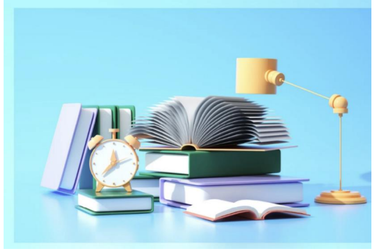
Figure 3: Integrate existing educational resources

Reading and writing are the external manifestations of students' learning English. In today's high school English classroom, it is necessary to improve students' reading and writing skills. Although the new round of curriculum reform has attracted more and more attention to English reading and writing, in practice, due to significant constraints, many urgent problems have emerged. For example, when reading an article, emphasis is only placed on whether students can provide correct answers to the questions after class, while neglecting their profound grasp of the theme and meaning of the article. Excessive emphasis is placed on explaining new words, while neglecting their summary of grammar application. Therefore, teachers should change their educational philosophy, starting from the comprehensive development of students, integrate existing educational resources, and adopt scientific and effective methods to improve the level and quality of reading and writing, so as to enable them to achieve all-round development [7-9]. When writing on a topic, I always start with the events that have occurred in my own life and guide my classmates to continue writing with my own focus. As shown in Figure 3.