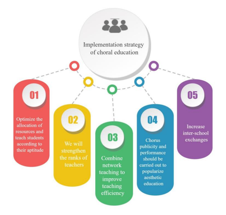
Figure 5: Implementation strategies for choral education