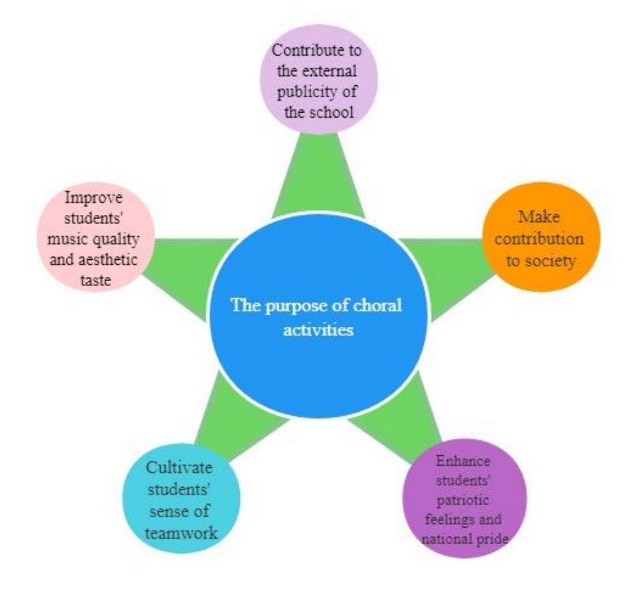
Figure 4: The purpose of college chorus activities