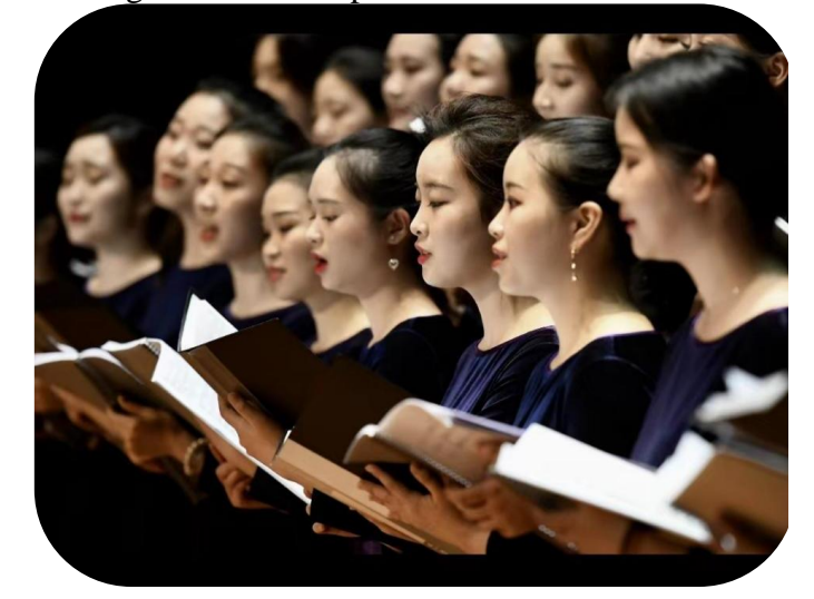
Figure 1: Choral practice

is composed of all kinds of college student associations, guided by professional instructors. Chorus courses and rehearsals are held every week, aiming to promote the development of college club activities, as shown in Figure 1 Compared with other schools, the choirs of music schools pay more attention to cultivating students' professional skills, and their members are all from music majors. Many music schools use chorus as a required course- -chorus and conducting, and students majoring in vocal and instrumental music should learn this course. In many schools, especially in preschool education majors, chorus is regarded as an important art education course<sup>[1]</sup>. Just as follows table 1.