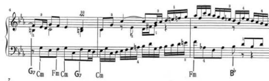
Figure 3: Score example3: Fugue bars 4-6

In the fourth bar, the piece develops into three voices, where the theme, the harmonic fill, and the melody appear (figure 3). The theme is in the bass voice, the harmonic fill is in the middle voice, and the melody is in the high voice. Here the middle voice is obvious, the notes and rhythmicity are simple and random, so that it is easy to find visually [3]. So in the treatment of the music, the harmonic fill is a part that we have to play a bit softer compared to the other voices. Of course, as harmonic fills, we must make sure that these notes are played evenly and smoothly, so that the harmonic inner dynamics of the piece carry the piece forward, rather than driving the mood through the harmonic weave, as in the romantic music that follows.