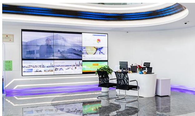
Figure 2: Multi-outlet Media Center

Since the establishment of Electric Shock News, the establishment of Guangdong Provincial Media Center has been placed in a prominent position, and two months later, the official media of 21 cities in Guangdong have been included at an alarming rate, and a central kitchen in the era of media integration has taken shape. Through the continuous provision of content in cities and counties, electric shock news has played a significant role in the information distribution platform, achieving high-speed integration and transmission of information, relying on mature content production processes, giving full play to the content advantages of traditional media, based on resource integration, and shaking the earth with the power of "four or two". Consistently, this method is universally applicable, and it is still applicable to universities in the western region when establishing a platform for media integration. Take the Propaganda United Front Work Department of colleges and universities as the center, do a good job of "news feast", mobilize the first-line advantages of various departments and departments, set up news collection and production outlets, form a linkage network that looks like a spider web and spreads from the center to the surrounding areas, seize the speed of news, integrate the quality of quasi-news with the power of the whole school, do a good job in campus propaganda work in the new era, and keep a good position in campus propaganda (Figure 2).