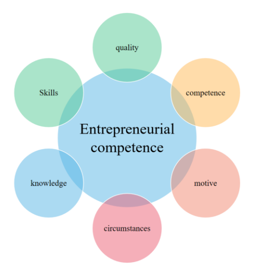
Figure 1: Structural model of vocational college students' entrepreneurial competence

By using "principal component analysis" to extract factors, and using "maximum variance method" to rotate the factor load matrix, it is finally determined to extract six common factors, and the cumulative variance explanation rate is 66. 365%. Whether the relationship between the extracted six factors and the six structures of the structural model is scientific.