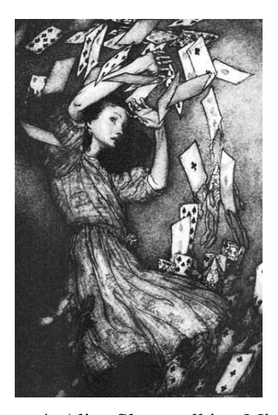
Figure 4: Alice Sleepwalking Mirror

Europe is the birthplace of western civilization, and its cultural inheritance and development are at the forefront in the world. As an important part of the cultural system, art presents different characteristics and trends in each stage of historical development. The reason why the watercolor illustration of Europe and the United States is not only because it is a habitual name, but also