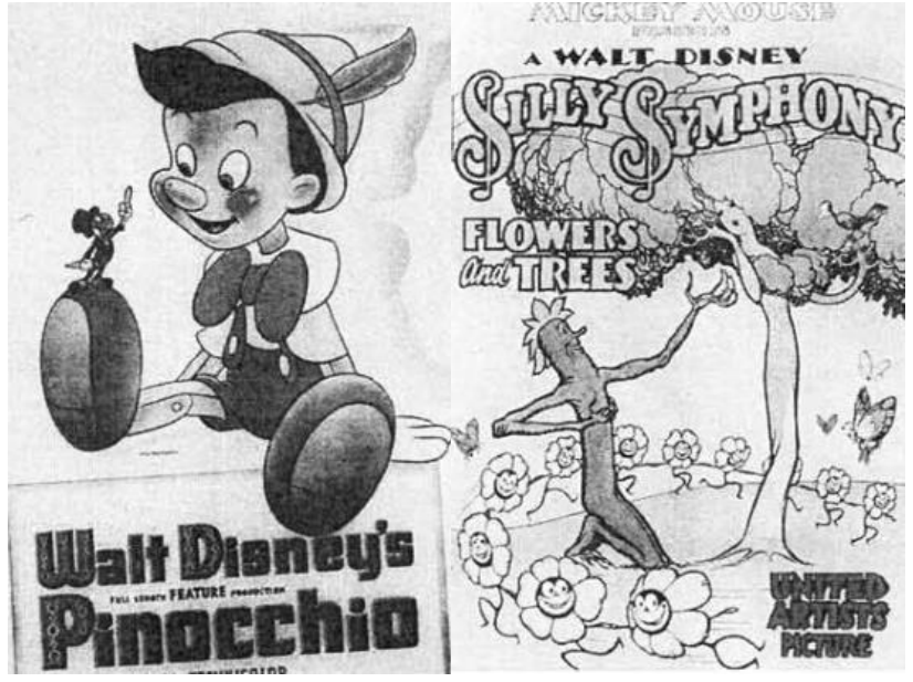
Figure 5: Pinocchio, Flowers and Trees

The most famous watercolor illustration work in the United States is Disney, which unites the immigrant culture from all over the world, closely combines watercolor illustration with the animation industry, and opened many famous animation companies, making the commercial value of illustration works reach the peak. Many of Disney's early works were created on the basis of watercolor painting. In 1932, it created the world's first full-color cartoon animation, Flower and Tree, in 1937, the first animated film, Snow White and the Seven Dwarfs, and in 1942, the second animated feature film, "Pinocchio"...... Its original shape is presented in watercolor painting technology. Later, with the improvement of ability and the development of technology, hand-drawn cartoons became the pride of Disney. For example, The Lion King became a popular work, which opened up a new situation for the application of watercolor painting in the art of illustration, just as shonw in Figure 5.