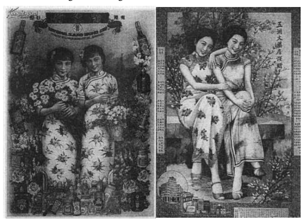
Figure 2: Hang a aying "month brand" works

The contemporary watercolor painter Guan Weixing is also one of the representative figures, creating important value for the application and development of watercolor painting in the art of flower arrangement. The illustration in Lin Haiyin's "Old Stories of the City" is written by Guan Weixing, which adds a lot of luster to the book and makes the plot and characters more deeply rooted in the people. Guan Weixing's watercolor illustrations pay more attention to humanistic feelings, technical skills and artistic attainments, which bring out the best with the words and were widely praised by the social crowd at that time. Mr.Guan Weixing carefully designed and rigorously studied every vessel, object, costumes and architecture in the South of the City, so as to ensure the