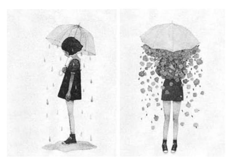
Figure 7: Lee Misook Watercolor illustration works