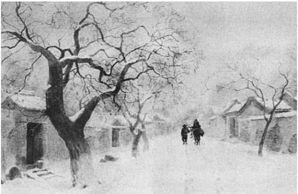
Figure 3: The illustration of "The South of the City"

effective coordination between illustrations and text and present the ideal effect<sup>[4]</sup>, just as shown in Figure 3.