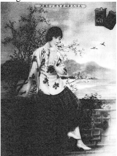
Figure 1: Zheng Mantuo's "Month card" works

Brand Toilet Water" [3], as shown in Figures 1 and 2.