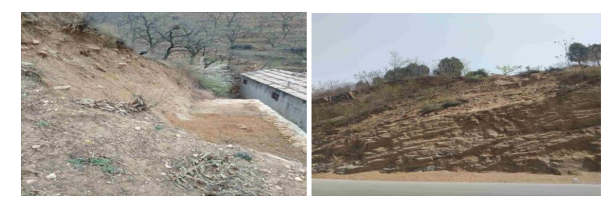
Figure 2: Geological hazard sites in Xindou District.