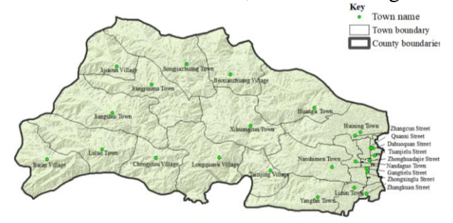
Figure 1: Administrative map of Xindou District

Xindu District is located in the west side of Xingtai City, Hebei Province, at the eastern foot of Taihang Mountain, which is connected with Shanxi Province through the mountain range on its west side, Xiangdu District of Xingtai City on its east side, adjacent to Shahe City of Hebei Province on its south side, and Neqiu County of Xingtai City on its north side. The total area of the territory is 1,941 square kilometers, accounting for 15.6% of the total area of Xingtai City. There are 25 townships and street offices in Xindu District, as shown in Figure 1.