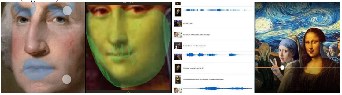
Figure 4: Hearing-A Digital Genealogy to Tell Later People

The art form is digital collage, which aims at making a genealogy of dynamic family photos. The content is to arrange the photos of the whole family in one picture or a continuous long picture by hand collage photos, and arrange the characters and scenes reasonably. Old people and children take photos with Talkr APP at the same time, make a talking family tree, record what you want to say to your family, and establish emotional connection. Through simple operation, shooting, 3D card position and recording can be realized, and the collage family tree can be turned into a talking digital family tree (Figure 4).