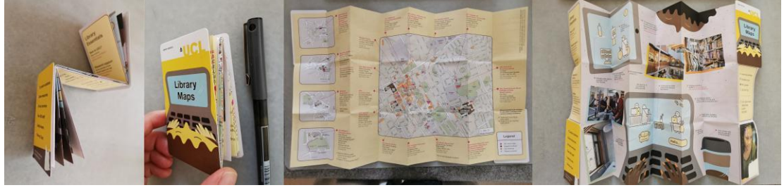
Figure 1: UCL Library MAP

The purpose is to intuitively feel the geographical differences and differences between teenagers and the elderly, see the differences in physical space brought by age, and understand age discrimination. Content: Old people and children visit the city museum, observe the regional changes from ancient times to modern times on the spot, and choose their own interests accordingly, including but not limited to the geographical space map of food, clothing, housing and transportation. Its inspiration comes from the memory loss of the elderly who are lost outside. Drawing a map can help to wake up the memory or ask for help (Figure 1).