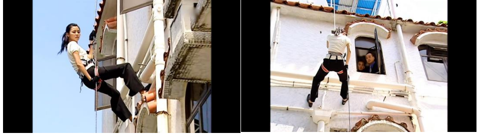
Figure 3: The protagonist team of "Forensic Pioneer 1" appears

The detailed design of typed characters, the audience can generally experience the "hero complex" through the police protagonist. They have extraordinary wisdom and agility, are resourceful and courageous in front of criminals, have firm determination and fearless spirit (Figure 3). But at the same time, the protagonist's imperfections also moved the audience. Most of the protagonists in early TVB criminal investigation dramas were portrayed as very everyday: they would have conflicts with colleagues due to their stubbornness at work, make mistakes in judgment during the process of solving cases, and encounter difficulties in relationships. and frustration, indecisiveness in triangle relationships, etc. For instance, characters like Jiang Zishan in "Criminal Detective Files," Yu Zilang in "The Ancient Spirit," and Zeng Jiayuan in "Forensic Records." Their characters are not perfect, and they have small flaws similar to those of ordinary people. There are also bad habits and other designs, but they make the characters more vivid and three-dimensional, making the audience feel and deeply convinced.