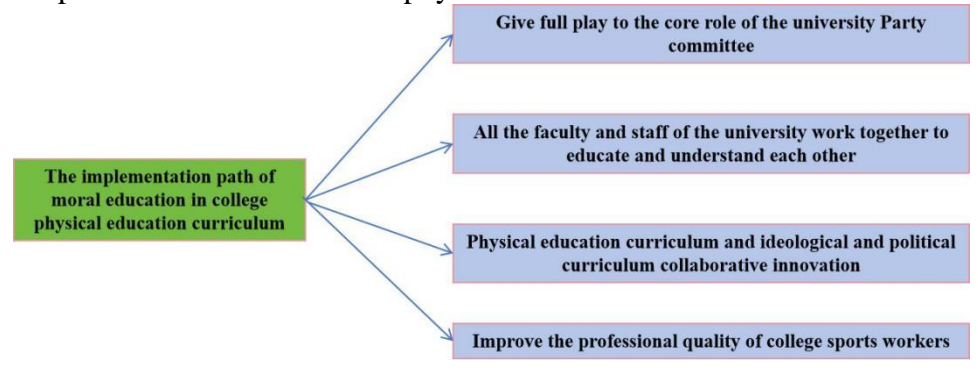
Figure 2: Implementation Path of Moral Education in College Physical Education Curriculum

Physical education curriculum moral education is a new field of moral education work in universities, and its implementation path requires comprehensive cooperation and cooperation from all departments of the school to achieve maximum effectiveness. Figure 2 shows the implementation path of moral education in physical education courses in universities <sup>[9]</sup>.