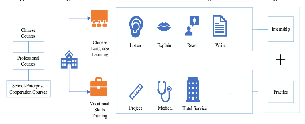
Figure 1: "Chinese+Vocational Skills" Training Model in Vocational Colleges

Based on the above analysis of influencing factors, this article constructs a "Chinese+vocational skills" training model for international students in vocational colleges. The "Chinese+Vocational Skills" training model designed in this article for vocational colleges is shown in Figure 1: