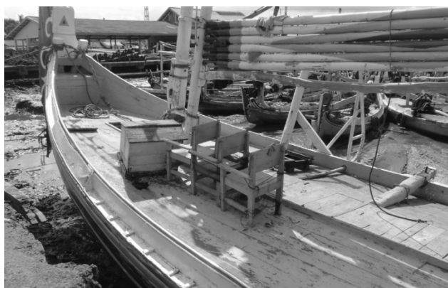
Fig. 3. The low bulwark and hatchway on Slerek fishing boat, Muncar

With regard to sanitary facilities, none of the fishing vessels in the two selected fishing communities have sanitary facilities on-board, even for vessels that go fishing for more than two weeks. It should also be mentioned that the respondents believe that a proper toilet facilities are not required on board. They argue that if they need to go to the toilet during their fishing trip they can simply use the side of the deck as a temporary natural toilet. Obviously it is an open space and the crew just hold on to the bulwarks or other structures at the deck side.