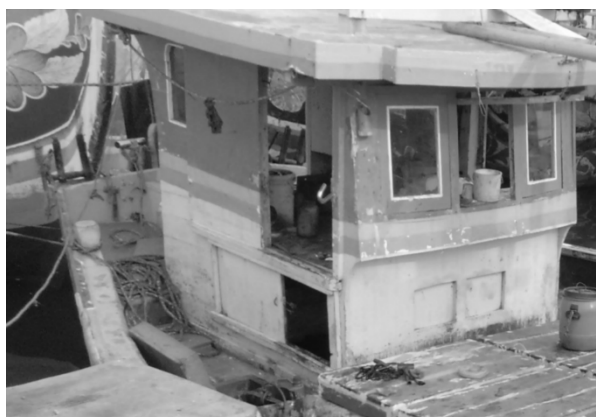
Figure 2: The access to engine room below the sleeping space for crew

With regard to sanitary facilities, none of the fishing vessels in the two selected fishing communities have sanitary facilities on-board, even for vessels that go fishing for more than two weeks. It should also be mentioned that the respondents believe that a proper toilet facilities are not required on board. They argue that if they need to go to the toilet during their fishing trip they can simply use the side of the deck as a temporary natural toilet. Obviously it is an open space and the crew just hold on to the bulwarks or other structures at the deck side.