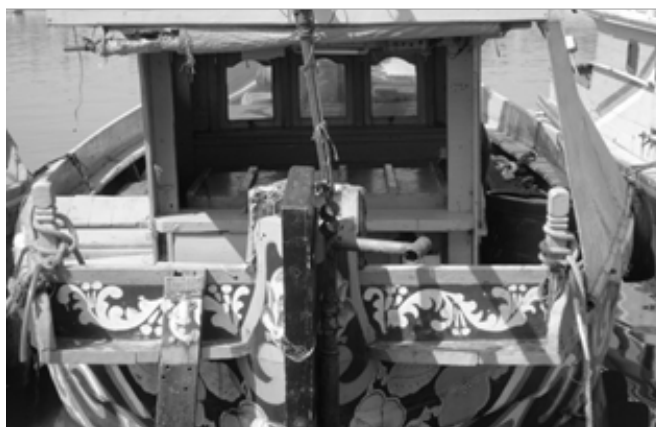
Figure 1: The accommodation space on “Ijon-ijon” Boat in Brondong

There are no proper accommodation facilities available on local fishing vessels in two selected fishing communities. For instance, the traditional fishing boat in Brondong, called “Ijon-ijon”, which is goes fishing for up to two weeks with about 10-25 fishers on board, only have a simple shelter approximately 2m x 3m, as seen in Fig.1. Most of accommodations on “Ijon-ijon” boats are not enclosed structure; therefore, it has no adequate protection against weather. The floor of the shelter, which is used as sleeping space, actually is the cover of engine casing in the form of moveable wood planks. Consequently, this crew space has no enough protection from the heat and the noise from the engine.