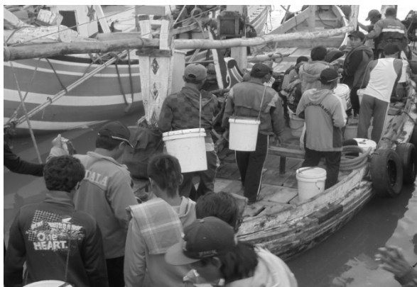
Figure 4: The bucket as substitution for life-saving appliances in Muncar

According to FAO/ILO/IMO recommendations, a lower hatch coaming height can be implemented as long as the water-tightness of the hatch cover can be ensured [11]. However, by considering the local fishers' awareness of safety on-board, the idea to employ lower hatchway coamings with a watertight cover system could be incorrectly maintained by local fishers.